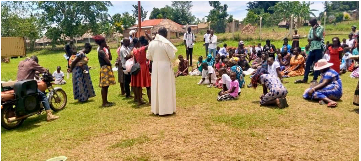
Easter Worship at Karin Grounds

There is something truly special about a community that prays together. It was a joy to welcome everyone to the Karin grounds for a season of worship and gratitude. We celebrate the blood shed for us and the love that unites us.